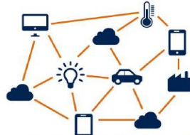
Internet of Things