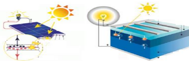
Figure 1 . When calculating the use of solar energy, the amount of energy emitted by sunlight per 1 m 2 of area is taken into account.

Sunlight is the addition of four atoms of hydrogen and one atom of helium. As we know, the thermonuclear reaction begins when the temperature inside the sun reaches T = 20 million ^{\circ}\text{C} . Therefore, thermonuclear energy is the primary source of all energy resources on Earth; coal, oil, gas; hydropower; wind and ocean energy. The sun is the source of all energy on earth. The sun emits an average of 88 \times 10^{24} calories of heat or 368 \times 10^{12} TVt of energy per second. However, only 2 \times 10^{-6} \% of this amount of energy, 180 \times 10^6 TVt, reaches the earth's surface. This is about 5,000 times the energy of all the world's permanent power plants.