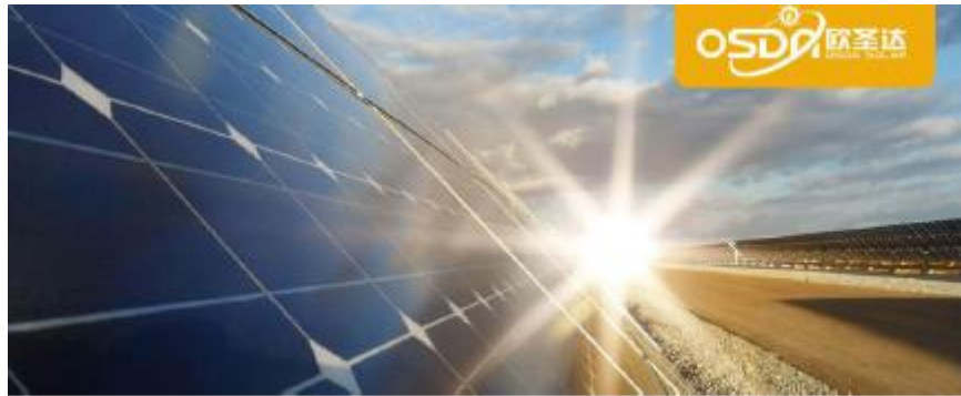
FIGURE 3. Panels of photoelements

normal levels and low material levels in the future due to heterostructure devices in the production of small amount of money is required.